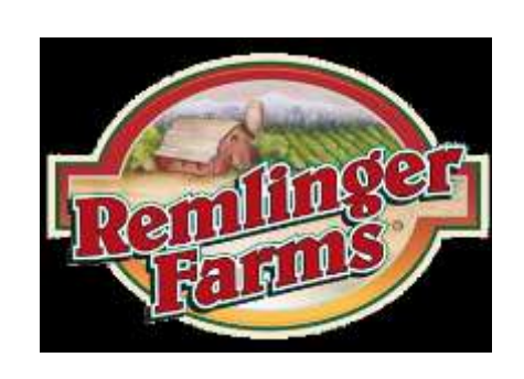
32610 NE 32nd Street Carnation, WA