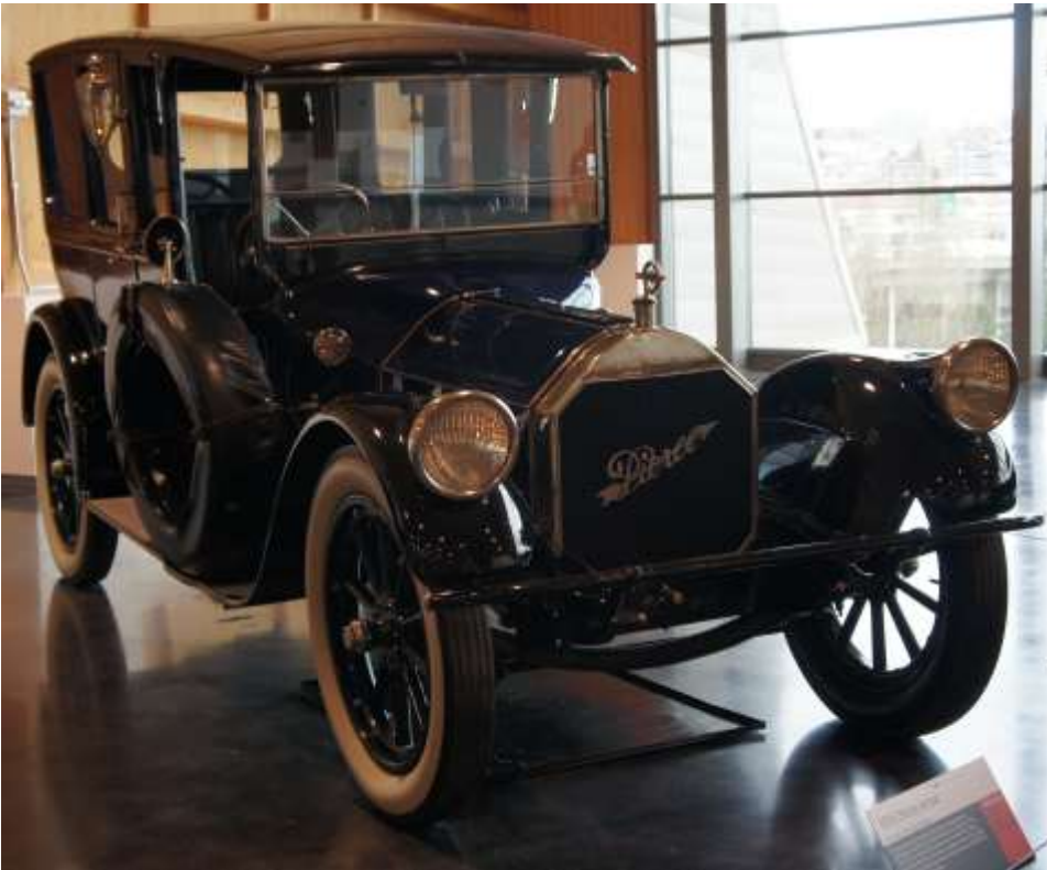
1916 Pierce Arrow