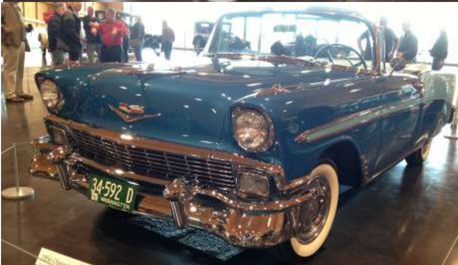
1956 Chevrolet convertible