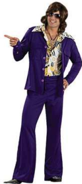
leisure suits and disco shirts... .