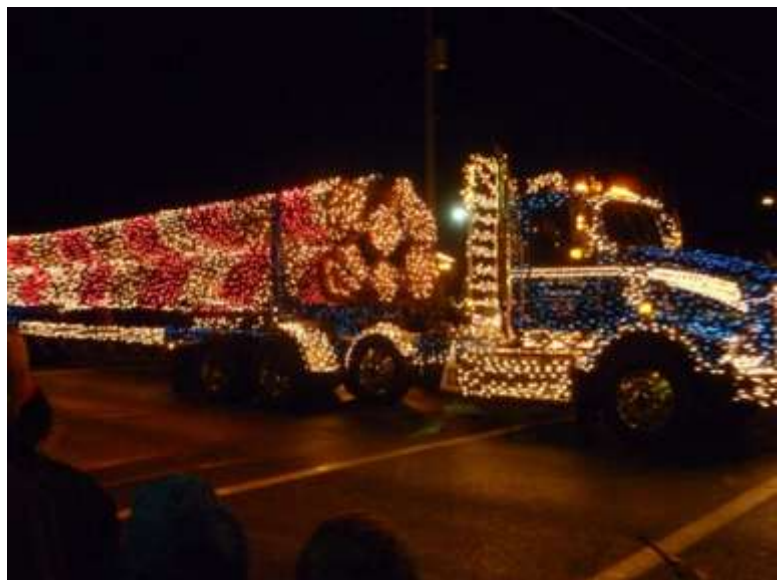
A fancy log hauler

About 4:30 we headed into town to pick out a good spot to watch the parade which would start around 6:00PM. Bob and Patty brought several containers of special "Peppermint Patty" hot chocolate that helped take the edge off of the cold damp weather. We all walked around town for a while exploring the various shops in the area. Finally the parade started and it lasted for about an hour. The whole town, it seemed, showed up to enjoy the great "Festival of Lights Parade". Being well fortified with our wonderful hot chocolate (Thank you Patty) we watched the great floats, marching bands, Log Trucks, Cement Mixers, Fire Trucks go by, with all sorts of people taking part in this great event.