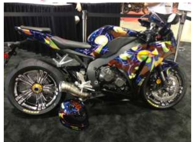
Ride-for-Kids CBR1000 to be raffled in May, 2013. Tickets are still available by following the web link at:

http://www.pbtfus.org/rideforkids/motorcycleshows/