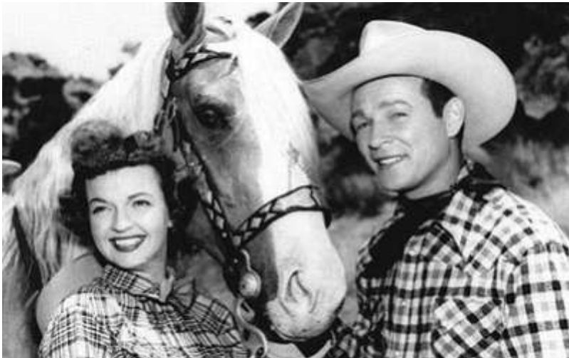
Roy Rogers & Dale Evans... and Trigger