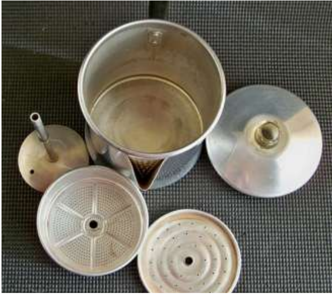
trusty ol' aluminum stove top coffee percolator