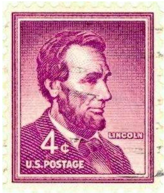
Four Cents Postage