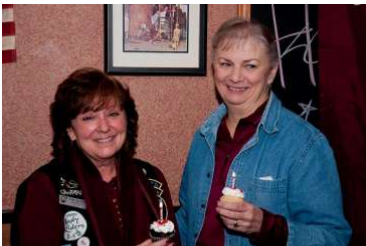
December Birthday Gals