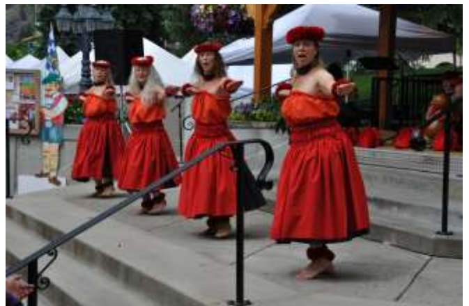
Intermediate stop in Leavenworth