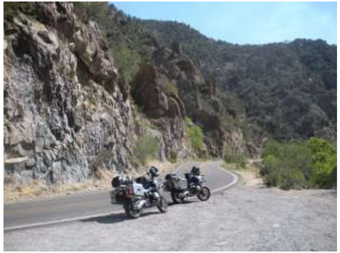
Fantastic riding in NM