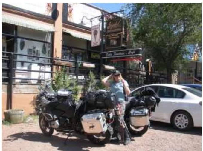
Madrid, NM looking for the Wild Hogs and the Del Fuegos!