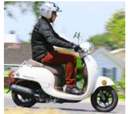
2013 Honda Metropolitan NCH50 scooter