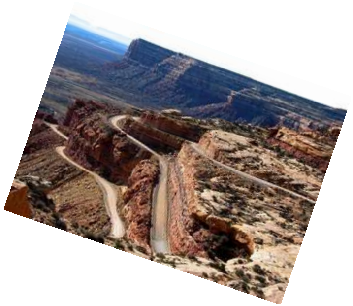
AMAZING riding in southern Utah! This is the Moki Dugway 1100 ft climb in 3 miles of dirt!