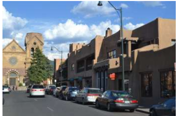
Great town with amazing art and architecture, great people, and great time!