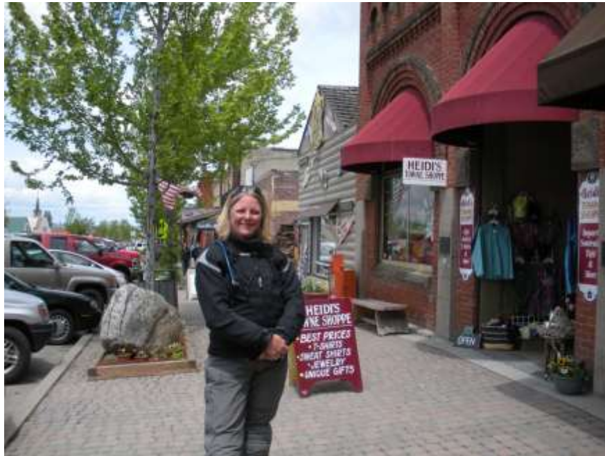
Joseph, OR makes the perfect stop for lunch after some amazing riding of twisties along the Hells Canyon.