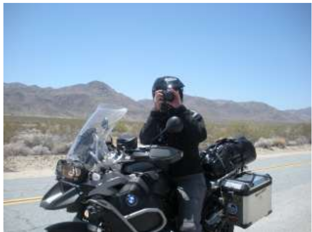
Taking pictures in Joshua Tree National Park