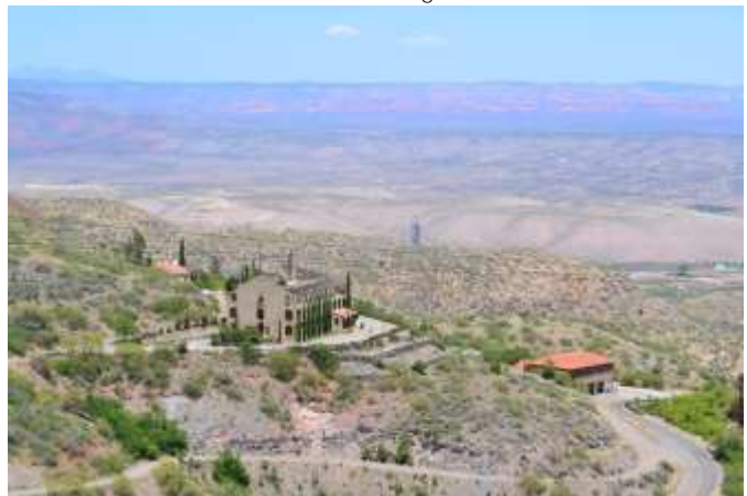
View from Jerome, AZ