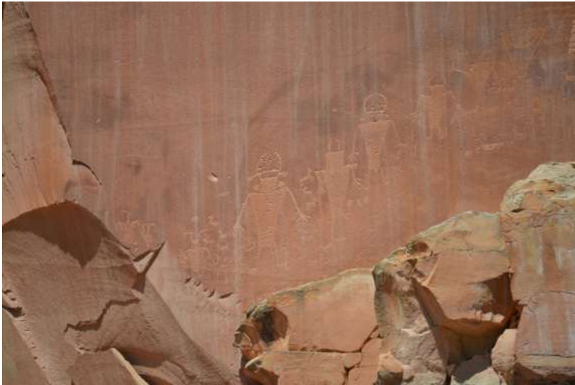
Great Petroglyphs in Capitol Reef National Park from the prehistoric Fremont people who lived from 700 to 1300 AD.