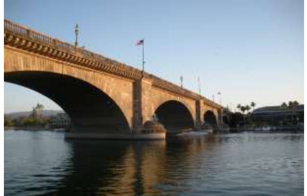
London Bridge on Lake Havasu, AZ