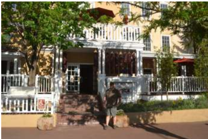
Our hotel in Santa Fe.