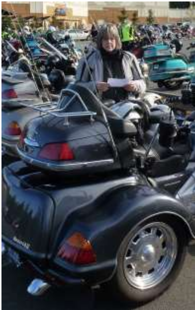
Hmmm..... These directions are complicated