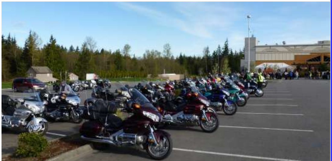
The Casino provided riders with a breakfast for 99 Cents