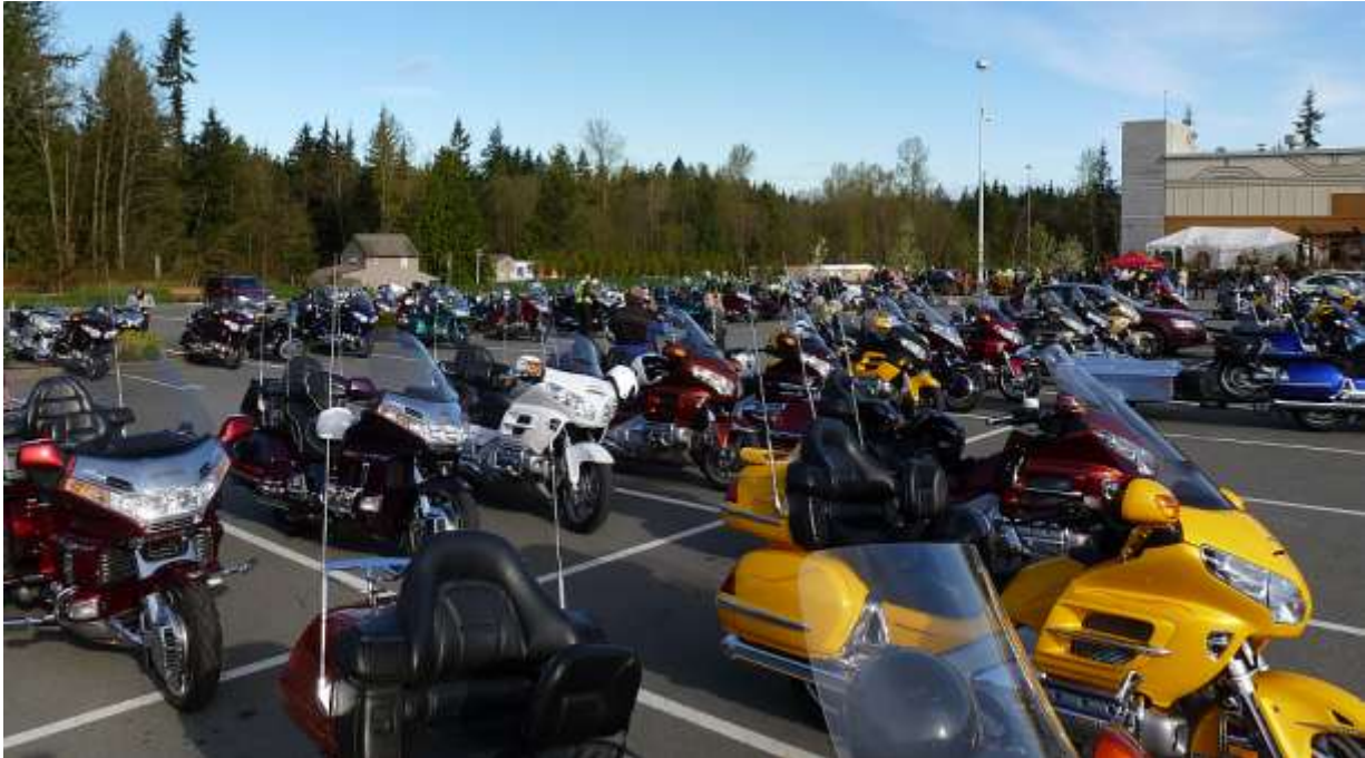
A sea of Bikes at the starting point in Arlington

The Annual Chapter C Fun Run on April 14th was a huge success with 165 participants showing up this year at the Angel of the Winds Casino in Arlington for the start of the ride. The event was extremely well organized and managed. Two grocery carts of food were collected and donated to the Everett Food Bank. One lucky grand prize winner also took home a $400 gift certificate good at Everett Powersports. The ride was broken into three segments with the riders/co-riders having to follow written route instructions which were given out at each checkpoint. We unfortunately we know of one group (which will remain nameless) who missed a turn point and had to double back. By the way, Chapter E had the largest chapter presence by having 17 participants show up.