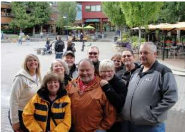
Ok, where do we eat next?