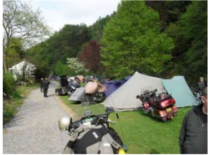
Goldwing Club Camping event

It appears that the club members enjoy group rides to other countries including Belgium, Luxembourg, Germany, and Switzerland.