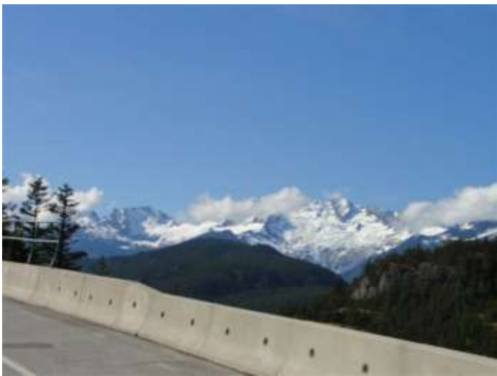
View from the highway on the way home