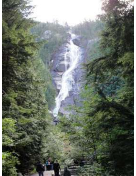
Water fall along the highway