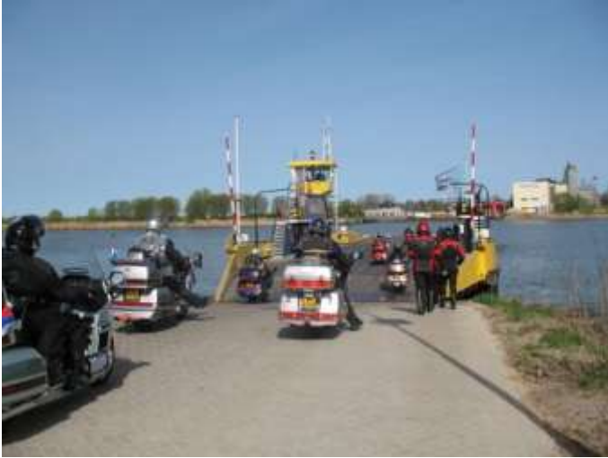
Goldwings boarding a river-crossing ferry in Holland