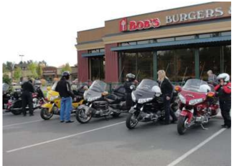
Late lunch at Bob's Burgers in Blaine on the way home