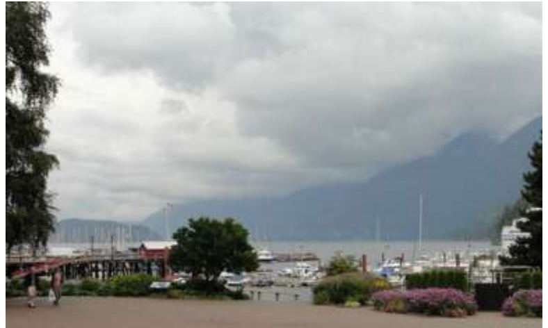
View of Horseshoe Bay from front of the restaurant