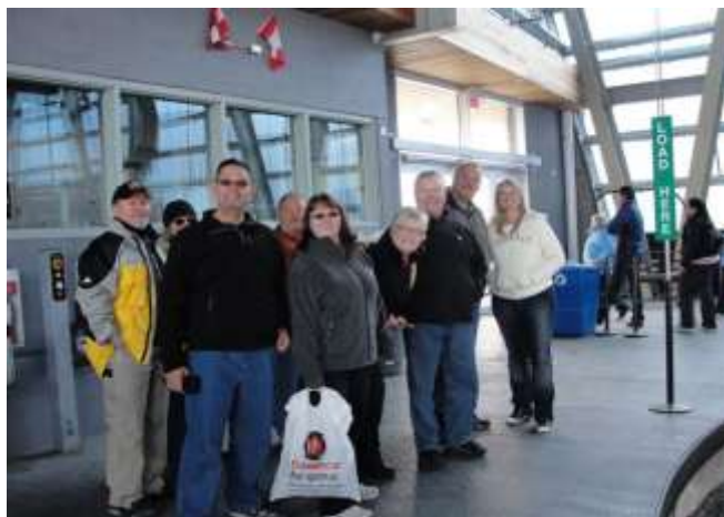
Waiting for our tram car, headed to the top of Whistler Mountain

On Sunday most of us took the tram up to the top of Whistler and then on to the "Peak to Peak" gondola over to Blackcomb. What an awesome ride. At one point we were more than 1400' above the valley floor and the people on ATV's below, looked like ants. It was cold on top and actually snowing where the gondola dropped us off at 8000'.