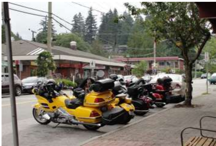
Parked for lunch at Horseshoe Bay