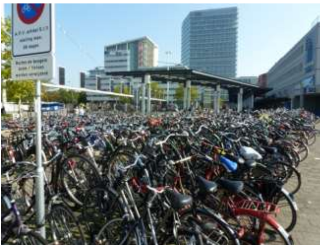
Let's see now.....where did I leave my bike?

Personally I enjoy my work trips to Holland and really love the friendliness of the Dutch people