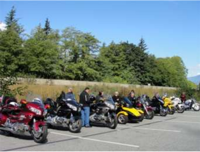
Quick stop at the falls along the "Sea to Sky" highway

Sunday night we all got together for a wonderful two and a half hour dinner at Earls in the village. The food was superb, the company perfect and a good time was had by all. As with all good things, it all has to come to an end sometime. Monday morning we all slept in a little and woke up to crystal clear blue skies. We all met for breakfast at a little Irish pub in the village then saddled up and headed South on what could be described as one of the most scenic highways in the Northwest. The "Sea to Sky" highway presented us with a perfect road surface and lots of twisties and long sweepers. What a great ride! The trip through the border was a little longer coming home (about a 20 minute wait) and much to our surprise "Leader Bob" made it through in record time. He didn't even have to go inside this time! It must have been Patty's sweet talking. After clearing the border we all gassed up in Blaine, stopped for a late lunch at "Bob's Burgers and Brew" then hightailed it south on I-5 for home, bringing an end to a terrific weekend. Can't wait until next year!