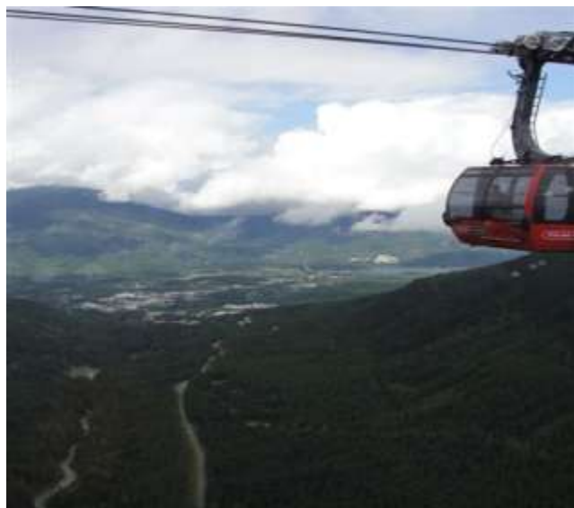
Hey - look how high we are!