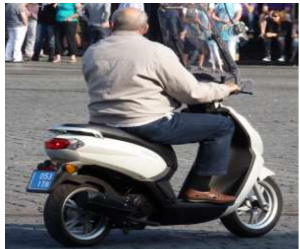
Scooters are very popular due to gas costs