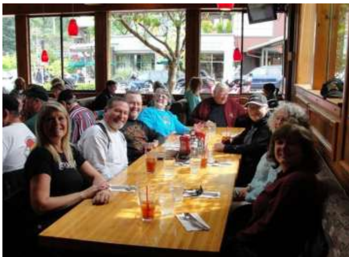
A bunch of hungry Goldwingers at Horseshoe Bay