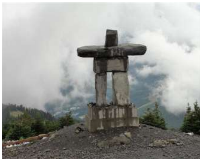
This is at the top of Whistler Mountain