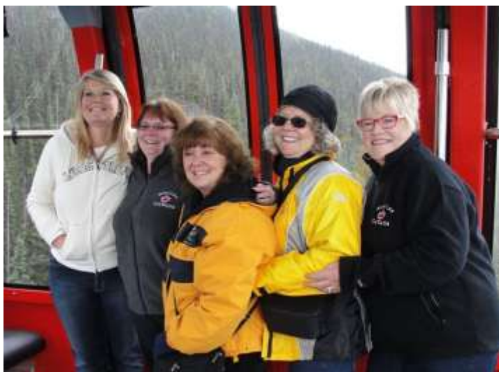
Five of the "Seven Dwarfetts" Silly, Yappy, Sexy, Sleepy and Moody. Not in any particular order!