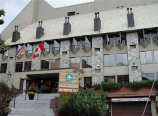
Our home for the weekend!