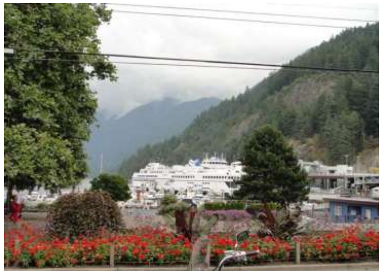
Another view of Horseshoe Bay from restaurant