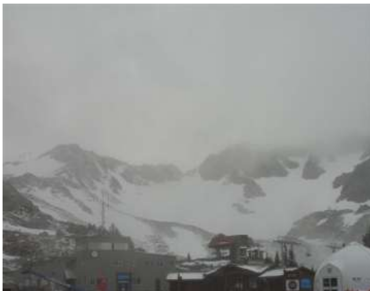
Burrrrr, it's cold up here! What's that white stuff?