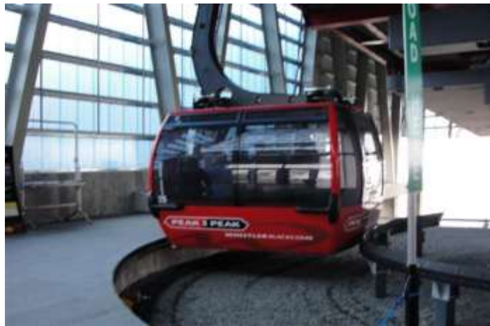
Here comes our ride!